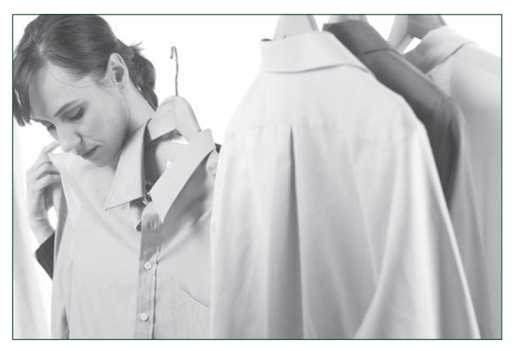
Regularly evaluate your wardrobe.