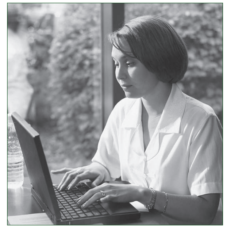
A simple blouse will never seem dated and makes a professional impression.

Business casual does not mean sloppy. Even in a "business casual" work environment, clothing should be pressed and never wrinkled, torn, dirty, or frayed. Any clothing that has words, terms, or pictures that might be offensive to others is unacceptable.