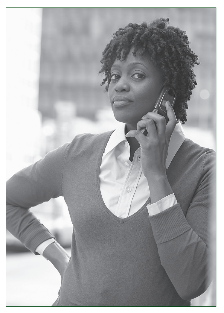
A sweater and blouse are always appropriate.